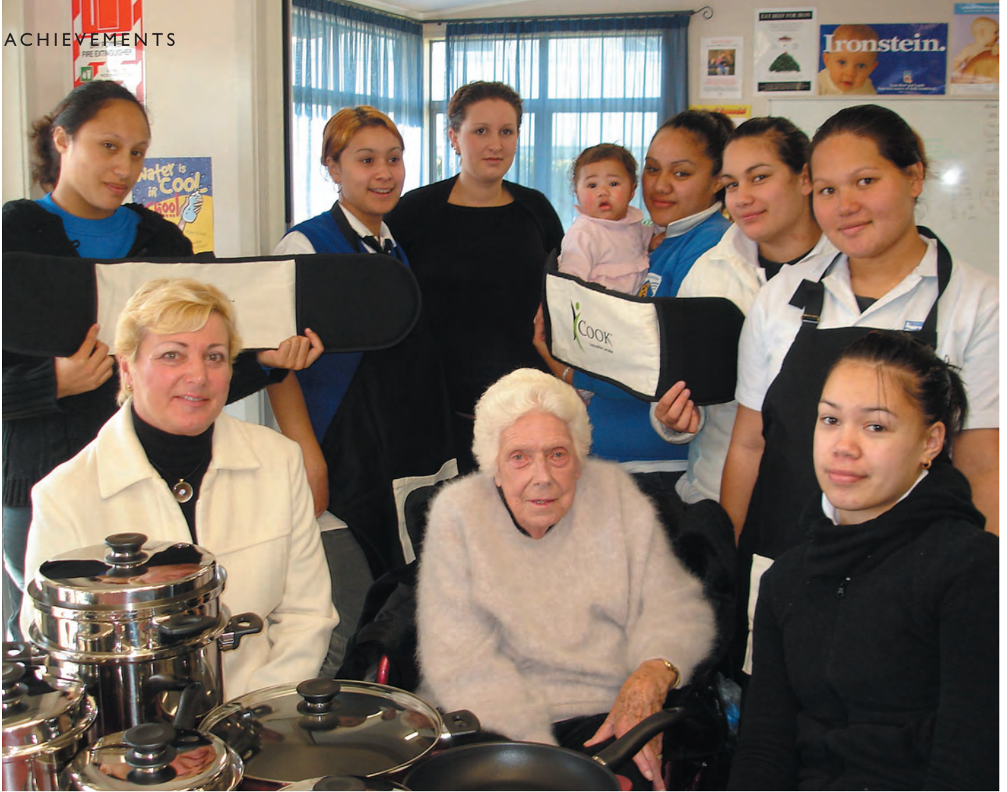
Donation of pots and pans, to Teen Unit, Tangaroa College, East Tamaki, from JP Enterprises.